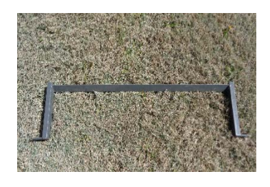
Large Solar Bracket