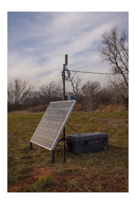
Side View Complete System