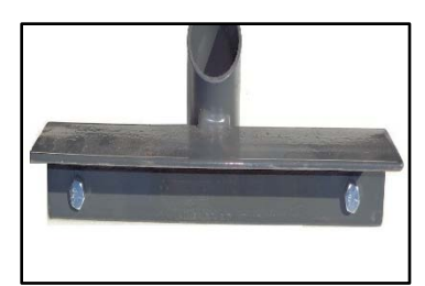
Small Solar Bracket